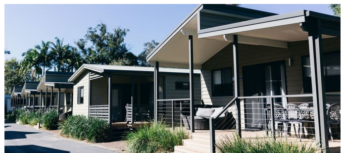
Cabins at the Big 4 Tweed Billabong Tourist Park

Recommended accommodation for overseas entrants without a veteran vehicle.