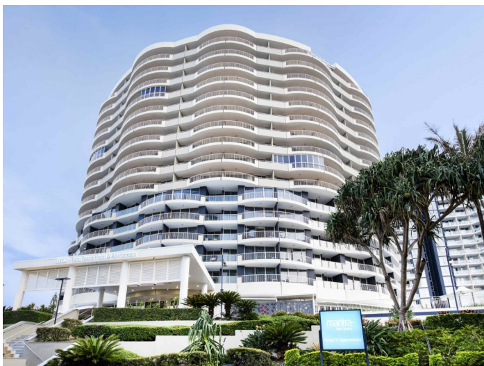
Sebel Mantra Twin Towns Apartments

One of the recommended tourist park properties