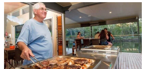
Camp Kitchen and common area within the Big 4 Tweed Billabong Tourist Park